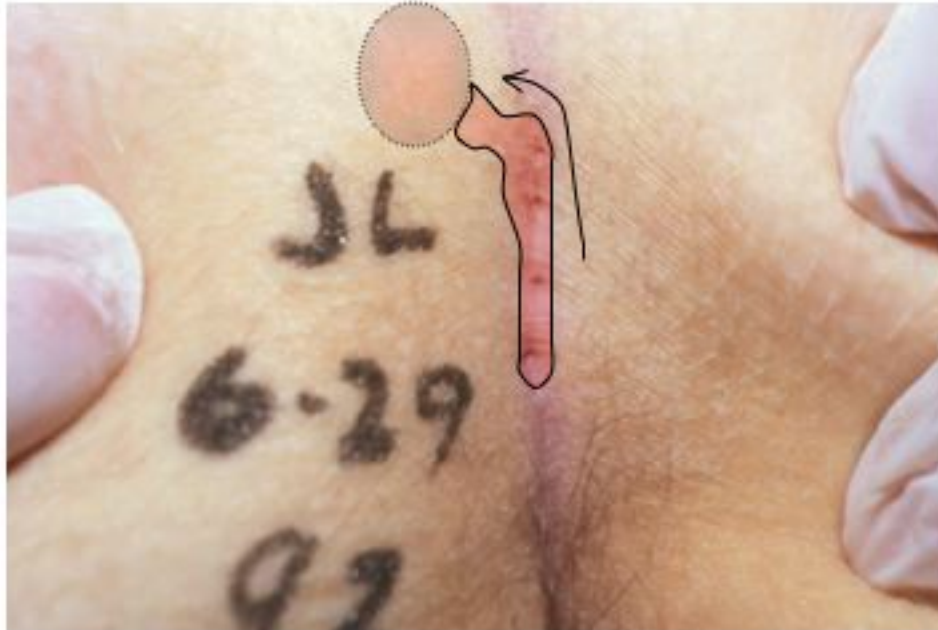
Path of infection from pits to chronic abscess