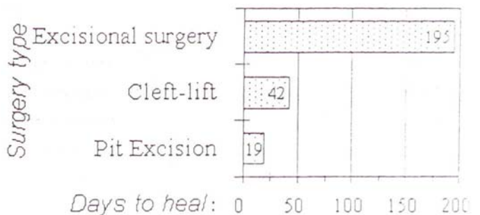
Figure 3. Average Healing time for three surgical procedures as treatment for Pilonidal Disease in this study. Excisional surgery not only has a high rate of recurrence, it often leaves a wound which never heals. In this study, 27% of the excisional surgery patients had a recurrence of the disease, and 21% remain unhealed. Surgery a treatment of PD should only be performed when necessary, after a trial of conservative treatment has failed to provide satisfactory control of the disease.

Most patients treated with excisional surgery healed (79%), but in an average 6.4 months with daily wound packing, and a significant rate of recurrence (27%). The remaining excisional surgery patients still have unhealed wounds (21%). See Figure 3.